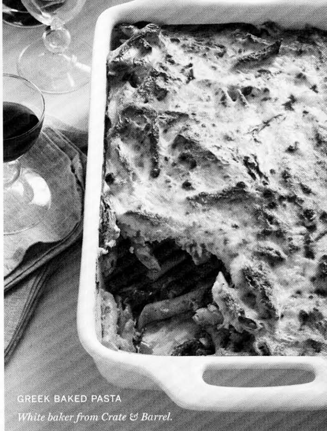
GREEK BAKED PASTA White baker from Crate & Barrel.

1. Preheat the oven to 350°. Bring a large pot of salted water to a boil. In a large saucepan, heat the olive oil until shimmering. Add the lamb, onion, oregano, cinnamon, cloves and a generous pinch each of salt and pepper. Cook over high heat, stirring frequently, until the lamb is no longer pink and any liquid has evaporated, about 8 minutes. Add the marinara sauce and bring to a boil. Boil over high heat, stirring occasionally, until the sauce has reduced slightly, about 5 minutes.